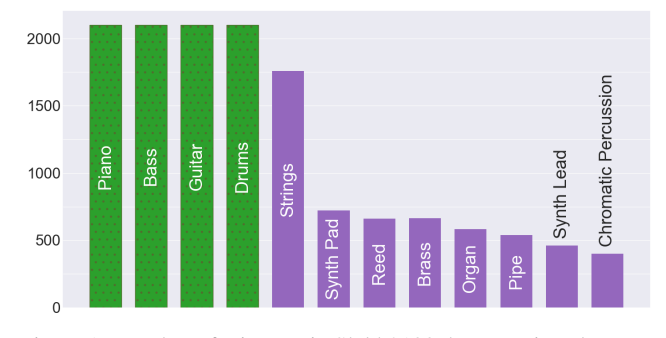
Figure 1: Number of mixtures in Slakh2100 that contain at least one instrument from the following categories. Every mixture has piano , bass , guitar , and drums (the four leftmost bars, shown in green.)