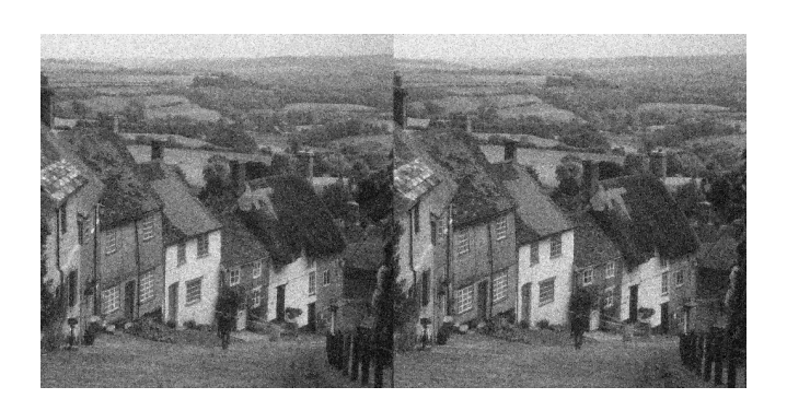
Fig. 5. LOBPCG with versus without the constraint

We propose accelerating iterative smoothing filters such as the bilateral and guided filters, by using the polynomials, generated by the conjugate gradient-type iterative solvers for linear systems and eigenvalue problems. This results in efficient parameter-free polynomial filters in the Krylov subspaces that approximate the spectral filters corresponding to the graph Laplacians, which are constructed using the guidance signals. Our numerical tests for one-dimensional signals demonstrate the typical behavior of the proposed accelerated filters and explain the motivations behind the construction. The tests