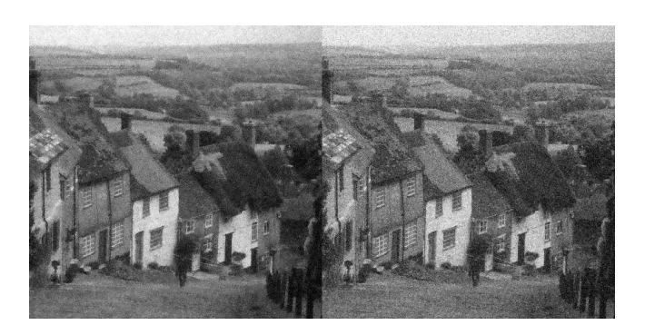
Fig. 4. BF filter versus CG