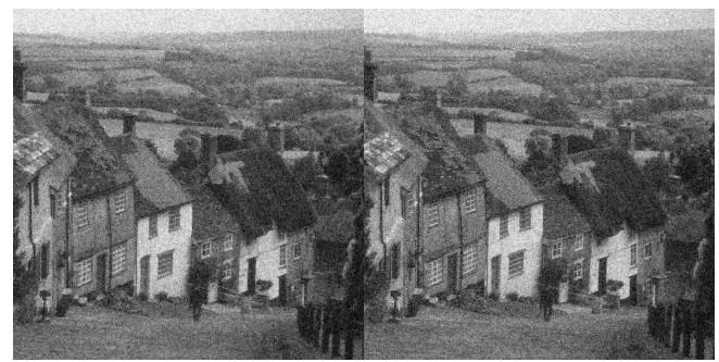
Fig. 6. LOBPCG with the constraint versus CG

showing image denoising reveal that the proposed filters are competitive. Our future work will concern accelerating the guided filters, testing the influence of non-linearities on the filter behavior, and incorporating efficient preconditioners.