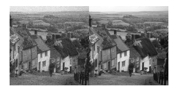
Fig. 3 . Noisy versus clear image: gaussian noise, mean = 0, variance = 0.01, PSNR = 20.1